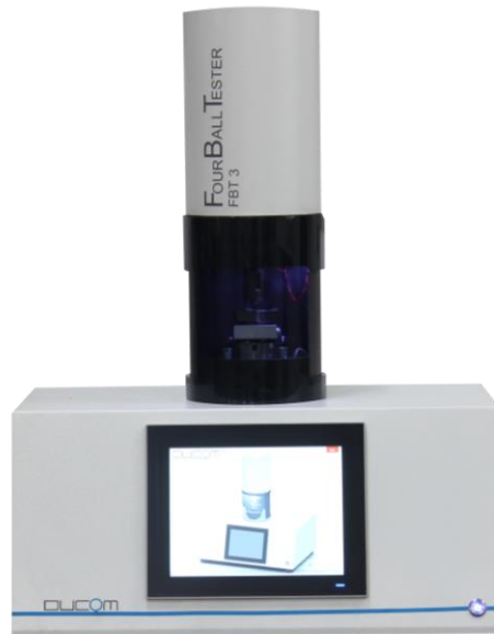
Figure 1. Ducom Four Ball Tester.